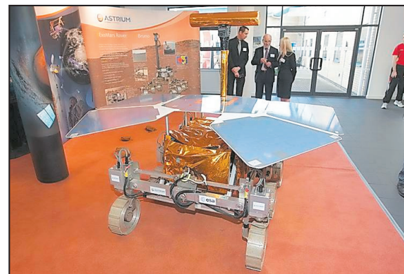
■ Prince Philip was shown a prototype of the Mars Rover (above) and (left) crowds turn out to greet the Duke